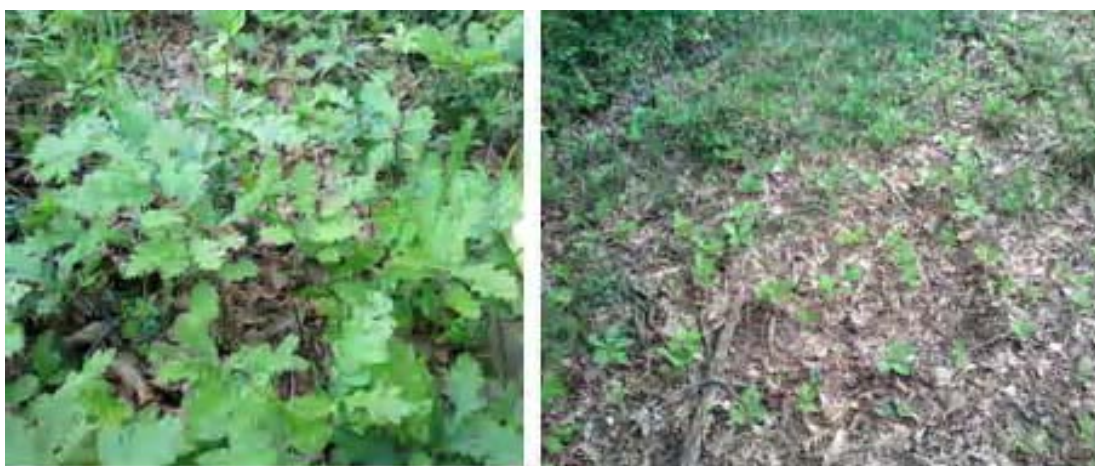
Fig. 3. Germination of acorns in the fenced area surrounding the meteorological station of ‘Campo di Rota’ (left) and in the adjacent open control plot in Castelporziano (the photograph was taken in the same day)

along the year, the water available in the soil is always higher than the wilting point, indicating that a sufficiently high water quantity is available to seedlings even in the driest summer periods (e.g. the 2005-2008 time interval as an example of exceptionally dry climate characteristics observed for four consecutive years).