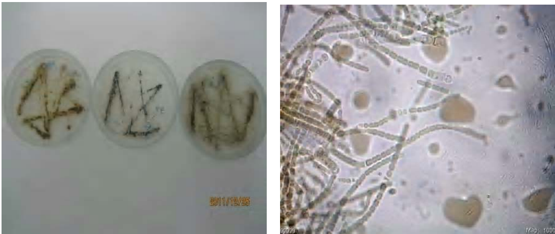
Fig. 1. Colonization of Microchaete tenera growing on agar plates (Left) and filaments close to oil droplets (shown with arrow key) in liquid culture (Right)

Cell dimensions are regularly used in determination of cyanobacterial species. Dimensions of cyanobacterial cells in optimally growing natural populations appear to be fairly stable with little intraclonal variability, although interclonal variability is higher within the same basic morphotype (Campbell and Golubic, 1985; Abed et al. , 2003). Detailed biometrical observations of this strain showed no remarkable change in vegetative and apical heterocyst cells dimensions. Furthermore the cells didn't tend to show akinetes in any treatments. As we know, the ability to develop akinetes (spore-like cells) is a survival trait of the Nostocales that provides these species with a competitive advantage over extreme conditions. These dormant cells survive in the harsh conditions in different extreme environments. As conditions improve,