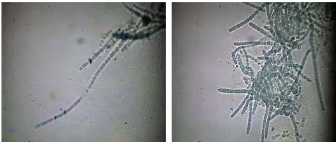
Fig. 2. Filaments of Microchaete tenera in control (Left) and polluted cultures (Right)