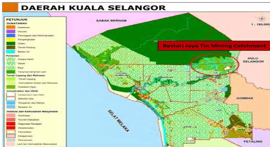
Fig. 1. Map of Bestari Jaya Catchment

Bestari Jaya catchment is located at 3° 24' 40.41" N and 101° 24' 56.23" E. It is a part of Kuala Selangor district, located in Selangor, biggest state of the country. District Kuala Selangor has three main towns namely, Mukim Batang Berjuntai, Mukim Ulu Tinggi, Mukim Tg.karang. Bestari Jaya is located in Mukim Batang Berjuntai. Tin mining activities has ceased from last ten years, now sand mining. The catchment has total of 442 small and big mining lakes and ponds. Bestari Jaya has a tropical, humid climate, with very little variations in temperature throughout the year. The