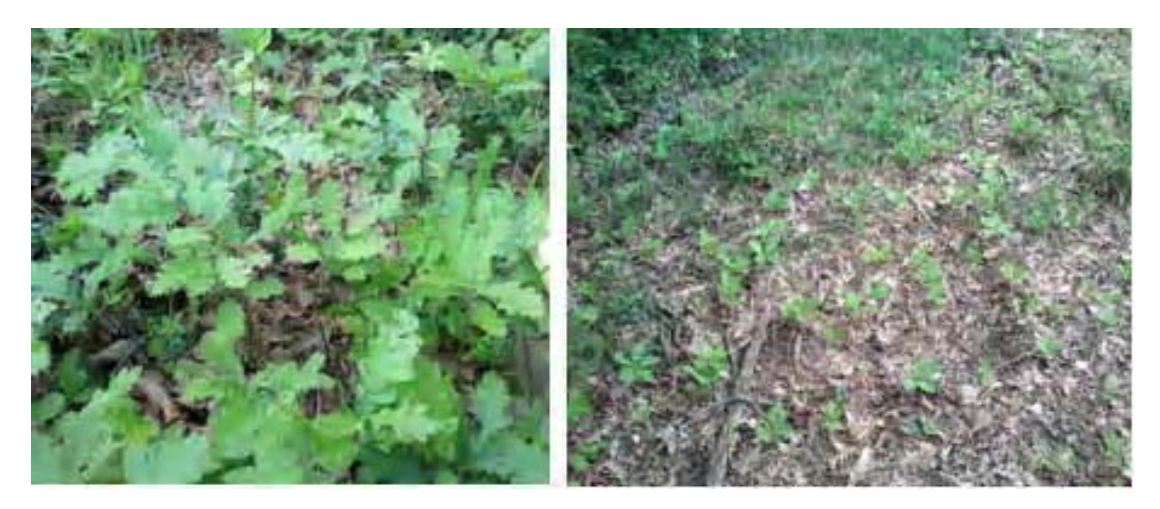
Fig. 3. Germination of acorns in the fenced area surrounding the meteorological station of 'Campo di Rota' (left) and in the adjacent open control plot in Castelporziano (the photograph was taken in the same day)

along the year, the water available in the soil is always higher than the wilting point, indicating that a sufficiently high water quantity is available to seedlings even in the driest summer periods (e.g. the 2005-2008 time interval as an example of exceptionally dry climate characteristics observed for four consecutive years).