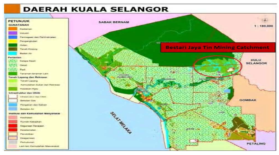
Fig. 1. Map of Bestari Jaya Catchment

Bestari Jaya catchment is located at 3°, 24' 40.41" N and 101° 24' 56.23" E. It is a part of Kuala Selangor district, located in Selangor, biggest state of the country. District Kuala Selangor has three main towns namely, Mukim Batang Berjuntai, Mukim Ulu Tinggi, Mukim Tg.karang. Bestari Jaya is located in Mukim Batang Berjuntai. Tin mining activities has ceased from last ten years, now sand mining. The catchment has total of 442 small and big mining lakes and ponds. Bestari Jaya has a tropical, humid climate, with very little variations in temperature throughout the year. The