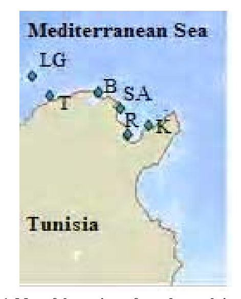
Fig. 1. Map of the stations of caged mussels in the North coast of Tunisia

and re-immersed for 10 days so they can re-cluster prior to transplantation (Galgani et al. , 2010). The experiment was carried for a three months period. Cages were deployed in six stations between April-May 2006 and were recovered in August 2006. Caged mussels were sampled at t = 0 (the beginning of transplantation) and t = 3 months (the end of the transplantation). A number of 30–40 mussels were dissected and the whole flesh was then lyophilized.