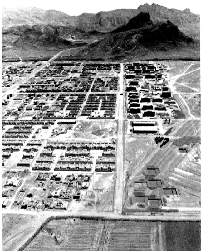
Fig. 2. Baharestan New Town in 1992